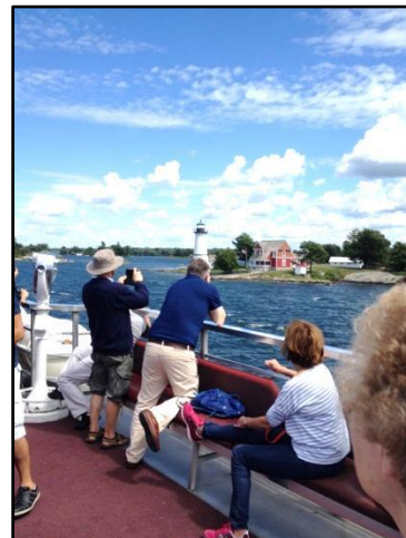
August 16, 2015 – Thousand Island Boat Cruise