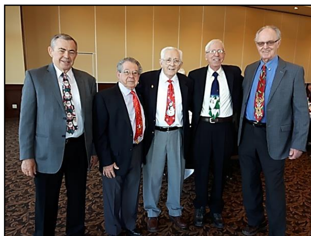
PROBUS Christmas Party, December 2017