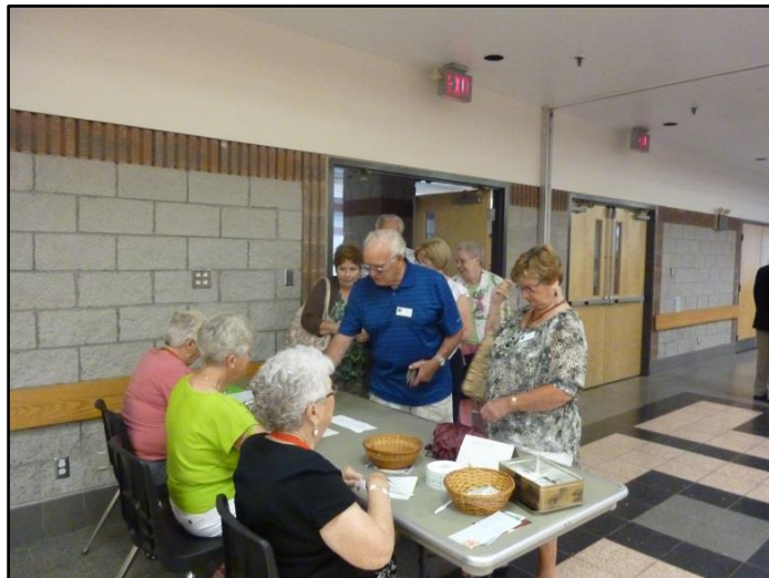
Pics from various 2012 Meetings